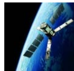
Artist's impression of SMOS

The campaign for validating the operation of SMOS (coSMOS) will be carried out in November and is designed to acquire a set of 'SMOS-like' observations to ensure that the mission's soil moisture retrieval algorithms are finely tuned and properly validated before the satellite launches in 2007.