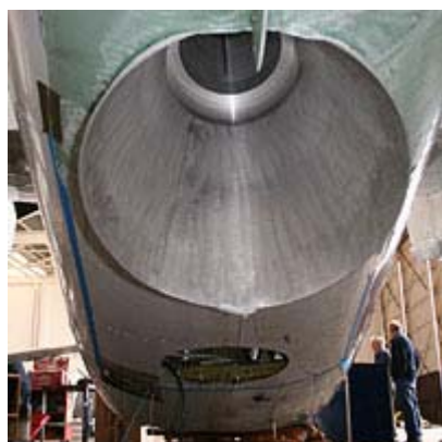
Installation of the radiometer's two large antenna horns