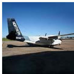
Aero Commander 500S Shrike

The development of the SMOS mission requires essential work in the field to study various effects on the signal. With the SMOS payload currently under construction, it is now time to fine tune and validate the retrieval-processing scheme by feeding it with SMOS-like datasets.