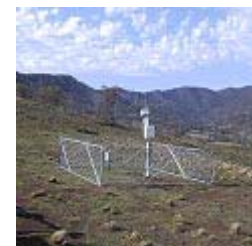
Weather and soil moisture measurement station

The primary use of SMOS data over land will be used for improving weather forecasts and water resource management and this requires regular and frequent monitoring of surface soil moisture. The coSMOS activities will test for the first time, with real data, the measurement approach being used for SMOS, and will also provide a test bench for assimilating such data in operational schemes. The campaign is essential in order to collect the last building blocks for the development of the SMOS ground segment and also to prepare for SMOS validation, which will be a crucial component of the overall mission concept.